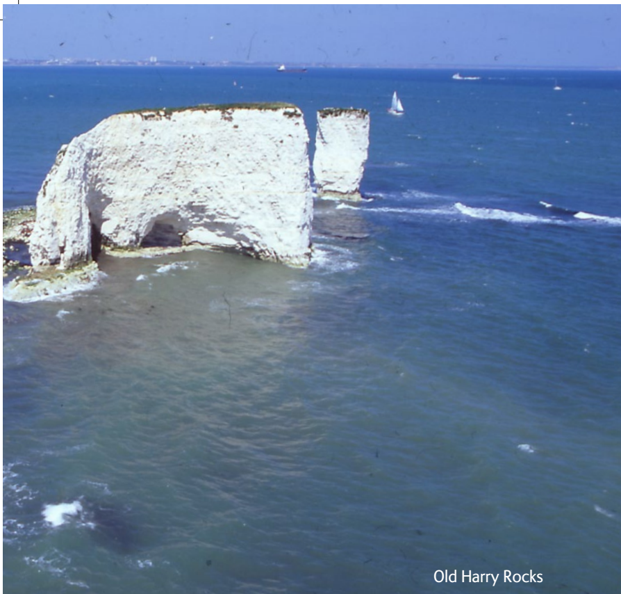
Old Harry Rocks

woodland. Studland and its beach lie ahead. After a few hundred metres of dusty walking, on the outskirts of Studland, follow the alternative route of the coast path sharp right, down to the sea. Turn left past a few beach huts, and then at the beach cafe turn inland up the sunken lane to emerge in Studland village beside some toilets. Turn right on to the tarmac road and pass the Bankes Arms and a National Trust car park.