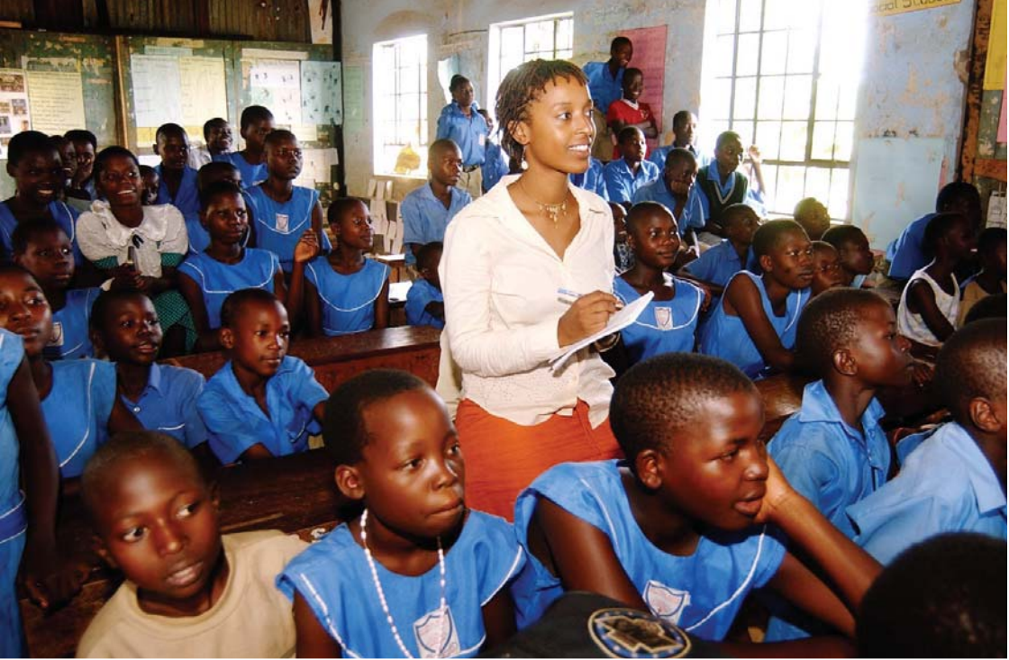
School children in Uganda hear the message about HIV/AIDS from a Canadian co-operative intern.