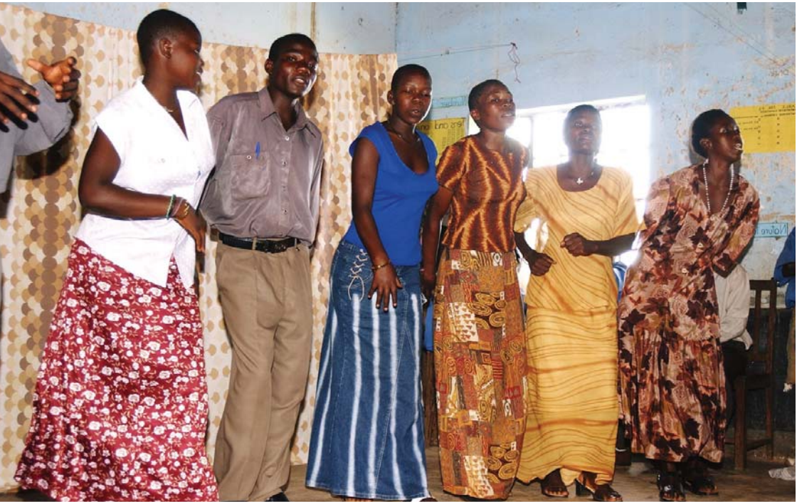
Members of the Kiyoola Youth Cooperative in Uganda perform a play for primary school children, to help them understand and avoid HIV infection.

The women had to overcome initial scepticism from Swazi chiefs to launch the co-operative, using a field which had previously not been cultivated. But with the success of the Mahlangatsha operation, they are now hoping to expand, and have plans to cultivate a second field in the southern town of