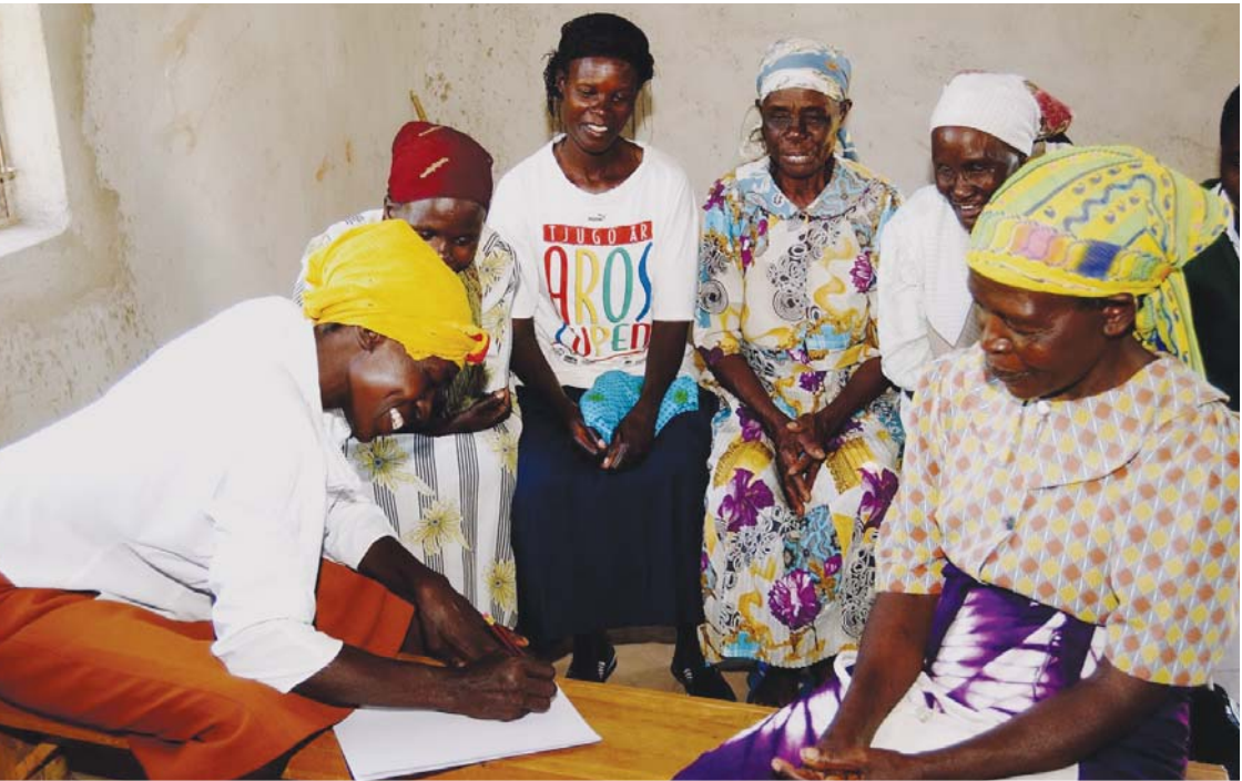
AIDS widows in Kenya participate in an art workshop to chart the impact that the disease has had on their lives.

There are also issues to address by co-operatives in countries particularly hard-hit by HIV/AIDS to ensure that they are adequately taking steps to protect their medium- and long-term financial viability. The World Council of Credit Unions explored in detail the implications for Kenyan credit unions of HIV/AIDS in a 2002 study which drew attention to the risks of default by members on loans issued. It suggested that this would affect credit unions’ profitability and could also, in certain cases, lead to bankruptcy. The report suggested several practical ways to minimise these risks. 13