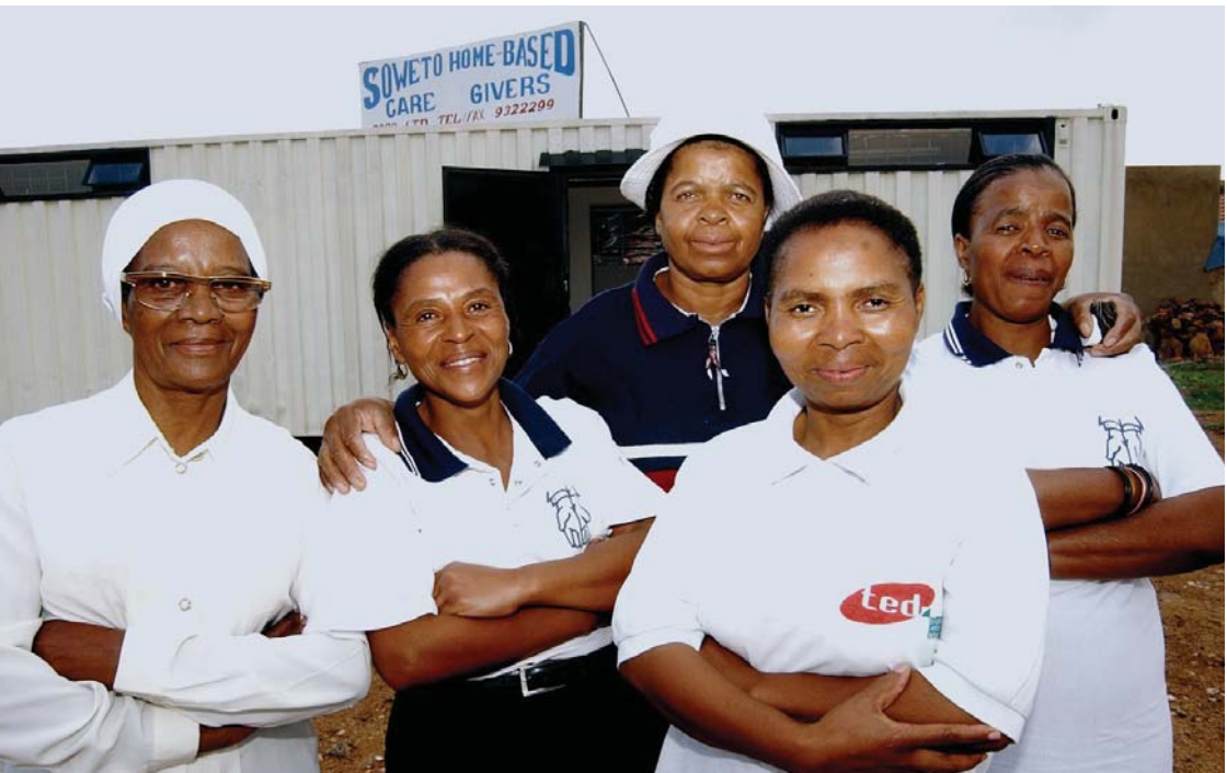
Members of the Soweto Home-Based Care Givers Co-operative outside the old shipping container which is their base.