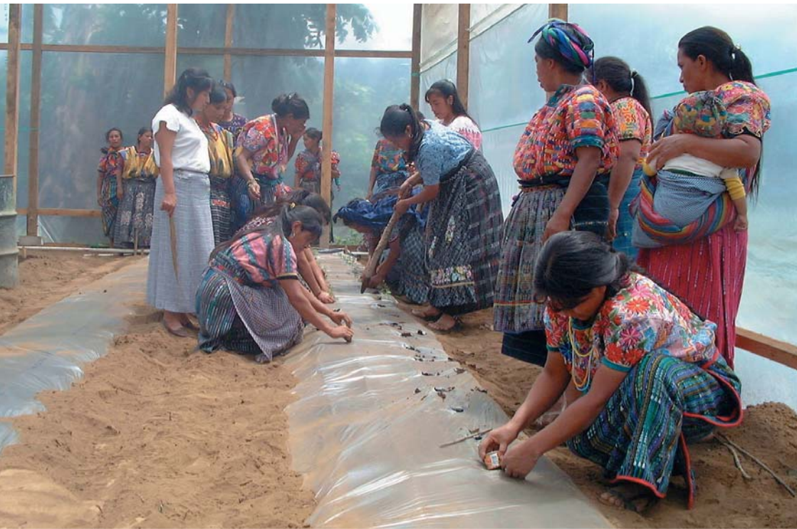
Greenhouse farmers in Guatemala.

Shared service co-operatives have proved successful both in Britain (among taxi drivers and small retailers, for example) and in developing countries. A good example of the latter is the shoe-shiners’ co-operative in Kampala, featured on the next page.